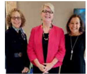
Know Your Options, September 12, 2019