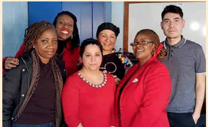
Arc of Illinois FSN Director presenting on Transition Planning, February 14, 2020 partnering with CPS