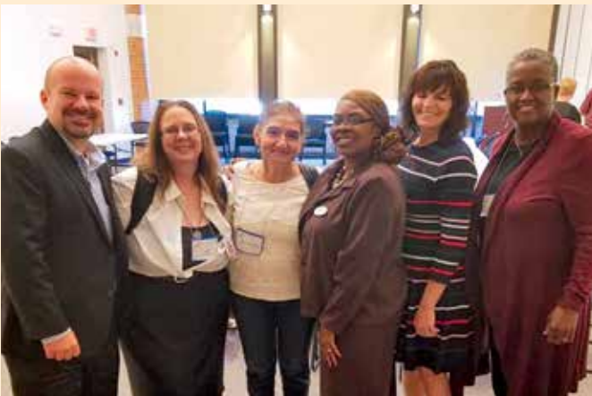
Ligas Program Director at Know Your Options Frankfort, IL September 26, 2019

An omnibus education bill that addresses, among other things, remote learning days and blended remote learning days during public health emergencies. It also includes language on the rights of parents to be provided materials in advance of special education meetings, the right to receive logs of related services provided to their child, and parental engagement in the MTSS/RTI process.