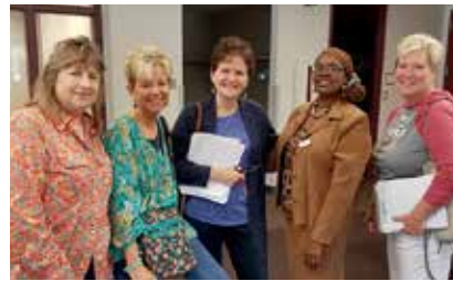
Arc/FSN Presentation at Palatine Public Library, September 13, 2019