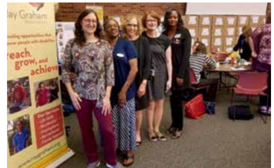
FSN, Director presenting at Ray Graham Series September 19, 2019