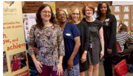
FSN, Director presenting at Ray Graham Series, September 19, 2019