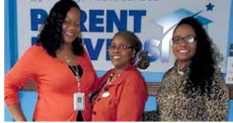
FSN Director partnering with CPS Bouchet Elementary Math Science Academy Arc Training, February 13, 2020