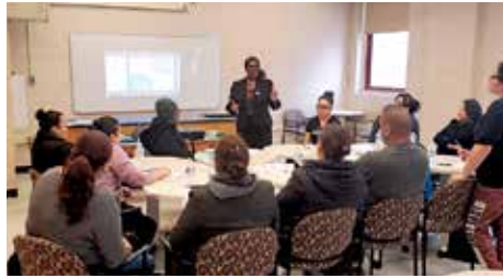
Arc of Illinois FSN Director presenting at Richards HS February 5, 2020 – Partnering with CPS