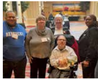
Arc staff, board and Arc Mentors at Executive Forum, February 5, 2020