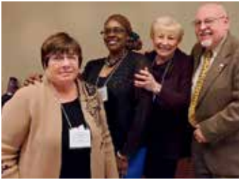
Partners and Policy, November 22, 2019