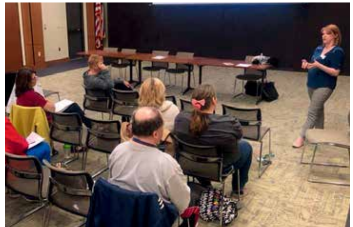
Know Your Options in Peoria

Families report numerous barriers and concerns. High quality CILA group home access continues to be difficult for families, particularly in southern regions of the state. Some families are navigating overwhelming mental health challenges and have shared their great difficulty in accessing even basic mental health support; their concerns often focus on whether the individual with mental health needs will have developmental disability specific needs that are "enough" to qualify under the Medicaid Home and Community Based Waiver. Many of these families have gone years without adequate or consistent services. Families come to the LFA programs with general concerns about being approved for waiver services and many struggle to access school/evaluation records that may assist them, as their individuals are years out from graduating or completing transition programs. For families who would like to utilize home-based services, concerns often focus on finding qualified and reliable PSW staff if they choose to not take that role on as parents. Transportation barriers are a consistent theme, with challenges in both access and consistency.