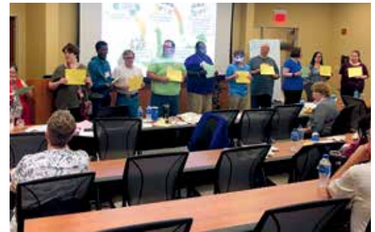
LFA, participating in the Alliance Arc Training August 28, 2019