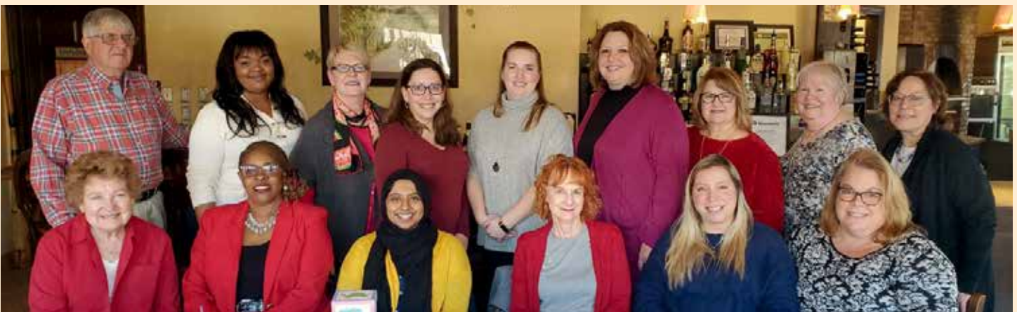
Arc staff and volunteers from across the state having a little get together time, December 11, 2019