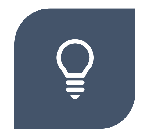
BULBS VS. SWITCHES – FOR ME, WENT WITH SWITCHES