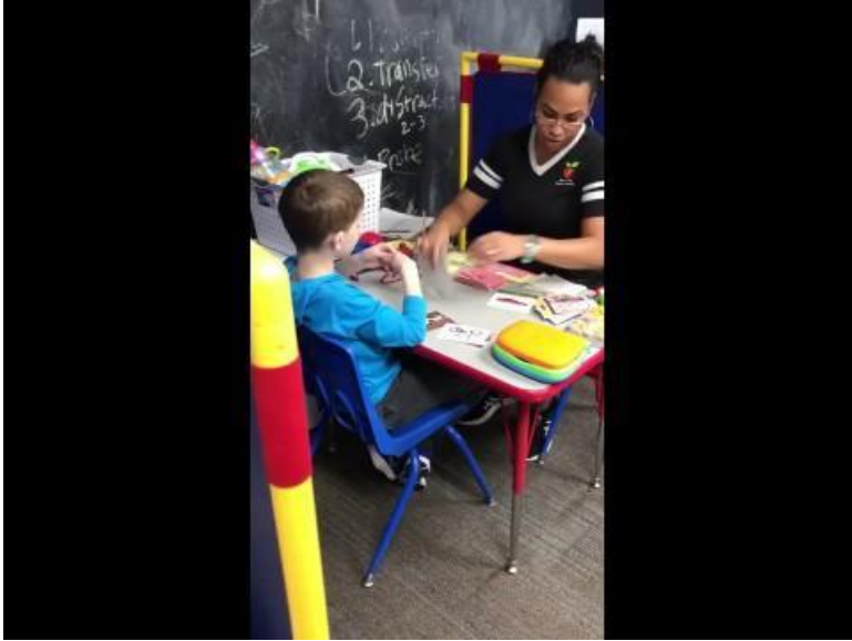
Discrete Trial Training