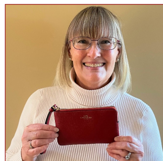
Linda Hall Hand Held Coach Purse WINNER