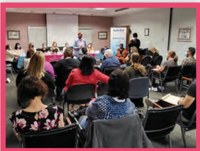
Thank you to everyone who attended the Aurora Listening Tour. It's important to provide opportunities for people living with disabilities, and those who support them, an avenue to express their thoughts and needs regarding resources, services and support.