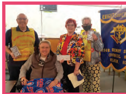
AID appreciates the very generous donations from the Elgin Knights of Columbus Council #654 (left) and Batavia/Geneva Knights of Columbus Council #2191 (right). These organizations work tirelessly to raise funds during their Tootsie Roll drives; so if you ever see them outside raising funds, give them a big thank you for supporting impactful community organizations like AID. Thank you to all of the Knights' members for your dedication and support over the years!