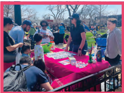
Thank you to the Elgin Police Department and The Autism Hero Project for inviting AID to participate in the Elgin Community Autism Awareness event in April! It was a great opportunity to inform the community about AID programs.