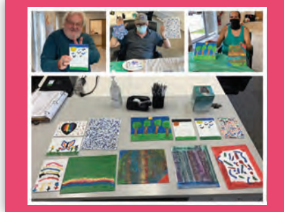
Our DeKalb office walls received a much needed pop of color thanks to our talented and artistic clients! AID DeKalb provides Behavioral Health Outpatient and Supported Living Services to the community.