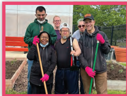
Thanks to generous funds provided by Kiwanis Club of Elgin, the AID Elgin Aktion Club was able to kickstart the O'Shea Center backyard garden. We can't wait to harvest the fresh produce!