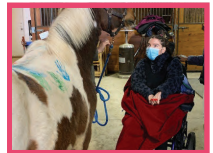
Students from the Aurora University Therapeutic Recreation program coordinated an unforgettable day at Reins of Change Equestrian Center for our clients. Thank you AU students and Reins of Change for this unique opportunity.