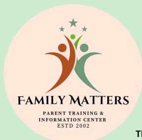
Family Matters PTIC logo, Pink Circle with small figures and stars

Register here: Family Leaders Collaborative Conference 2024