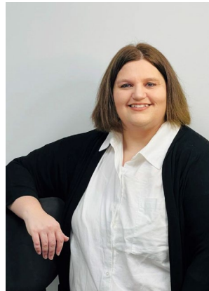
Smiling woman, shoulder length brown hair, white shirt and black cardigan